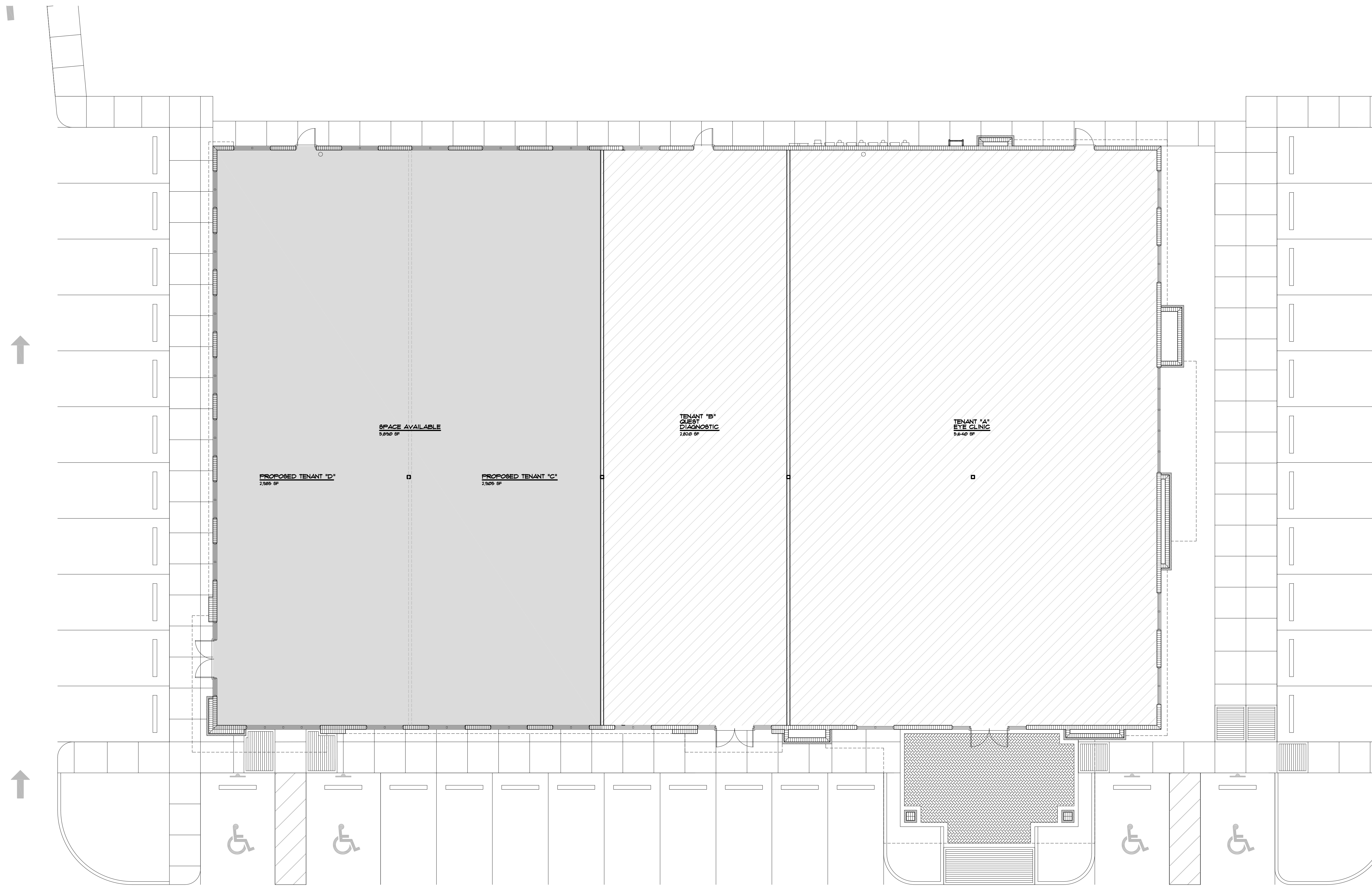
1 PROPOSED FLOOR PLAN SCALE: 1/8" = 1'-0"