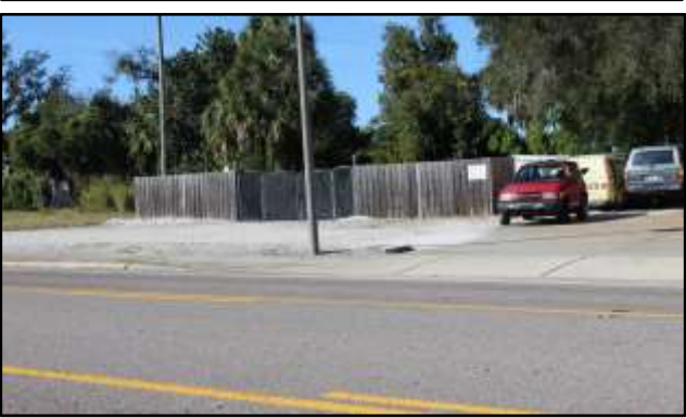
The information contained herein was gathered from sources believed reliable; however, Klein & Heuchan, Inc., or its agent, cannot be responsible for errors, omissions, changes, withdrawal, or prior sale.